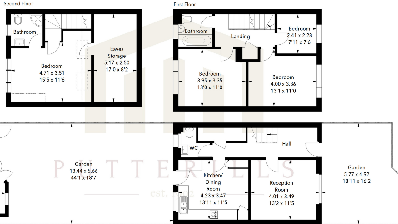
Illustration For Identification Purposes Only. All measurements and areas are approximate, not to scale.