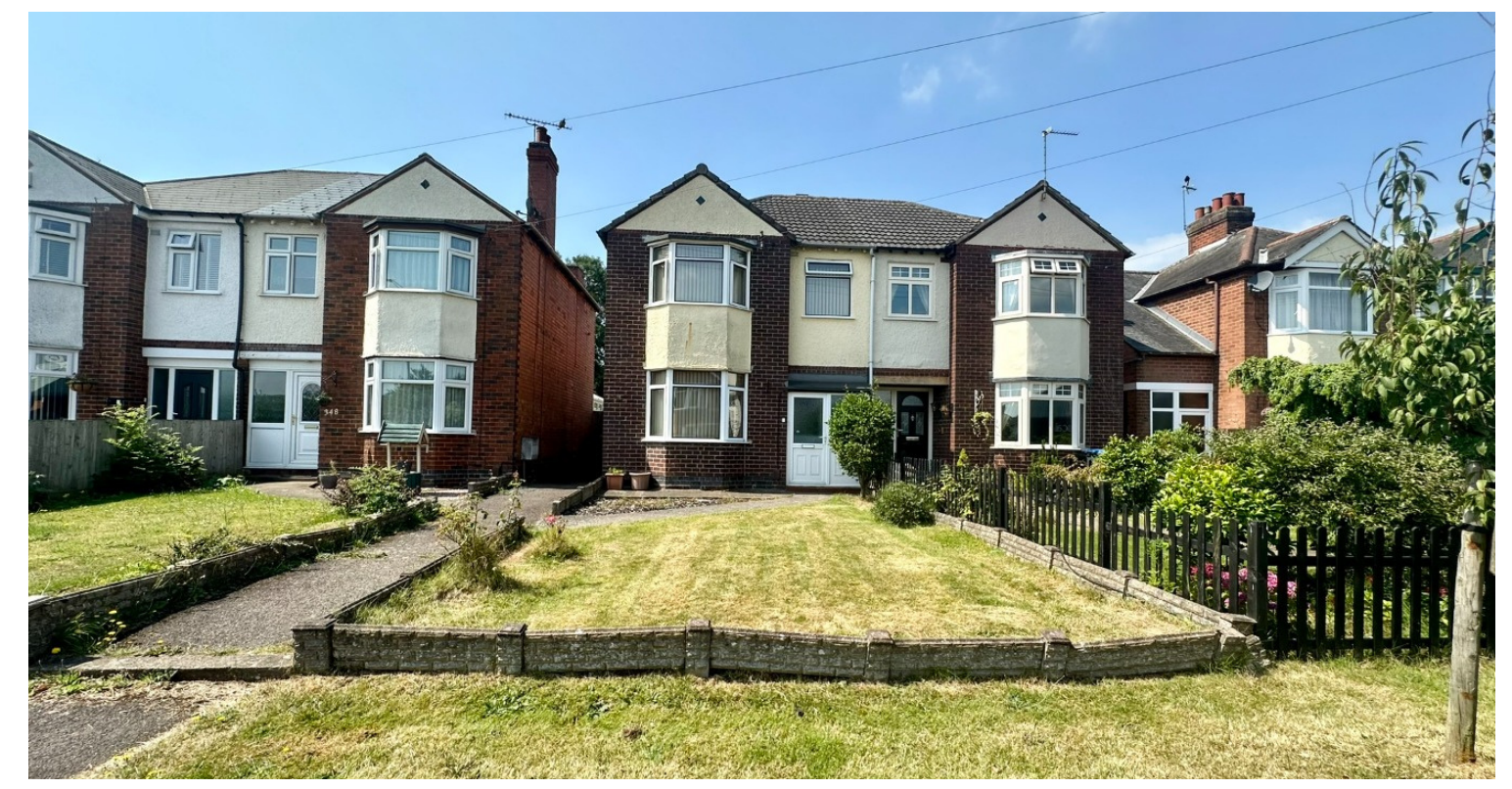
3 Bedrooms | 1 Bathroom | 2 Reception Rooms | Garage