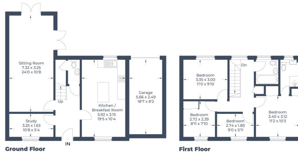
Illustration for identification purposes only, measurements are approximate, not to scale. © CJ Property Marketing Produced for Love Homes

Approximate Gross Internal Area Ground Floor = 63.3 sq m / 681 sq ft First Floor = 51.5 sq m / 554 sq ft Garage = 14.1 sq m / 152 sq ft Total = 128.9 sq m / 1,387 sq ft