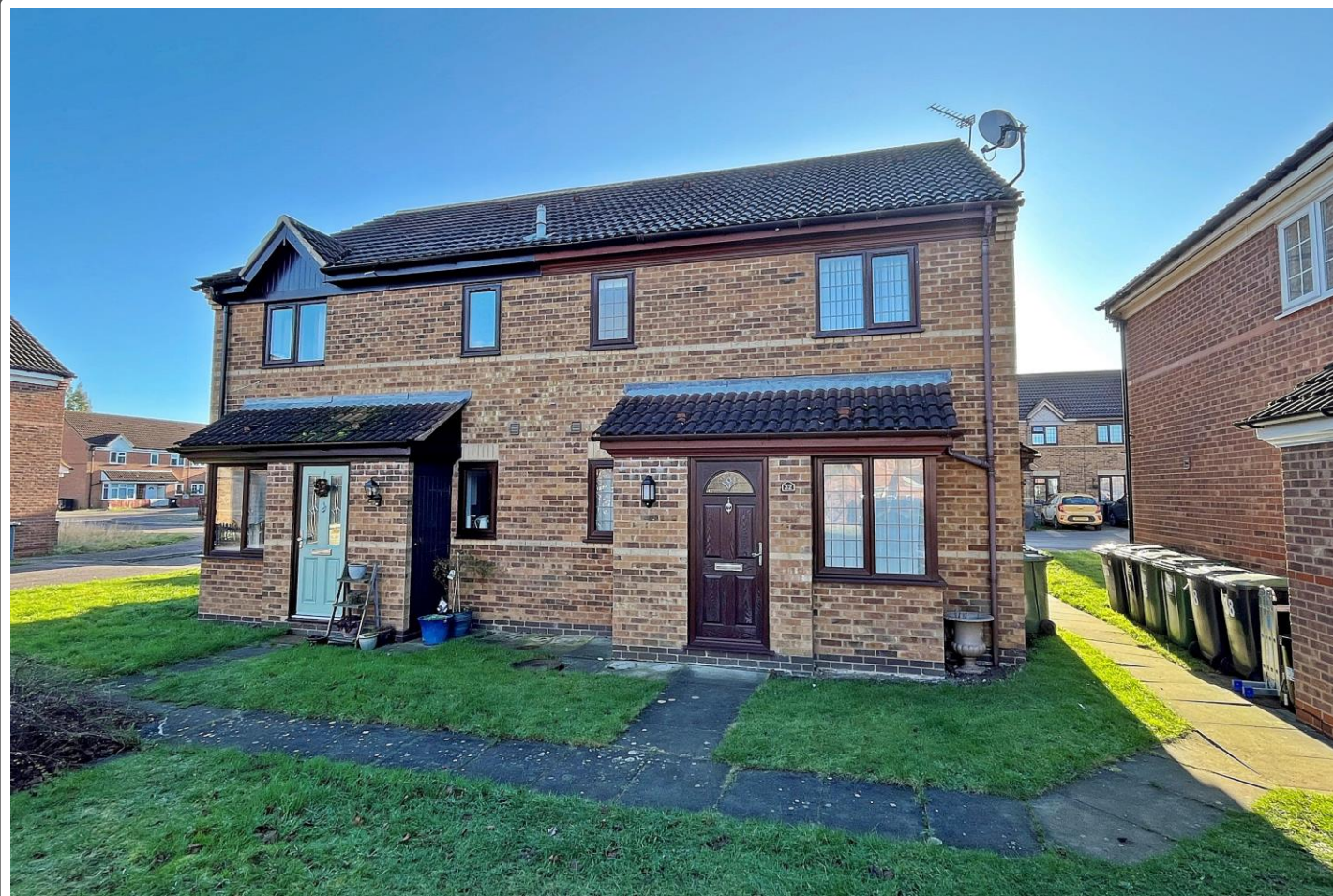
The Paddocks, Flitwick, Bedfordshire MK45 1XF