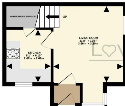
GROUND FLOOR 225 sq.ft. (20.9 sq.m.) approx.