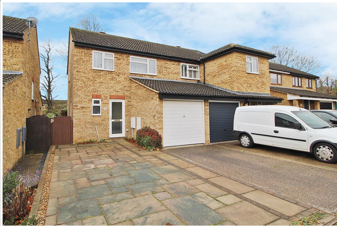
Avon Rise, Flitwick, Bedfordshire, MK45 1SQ