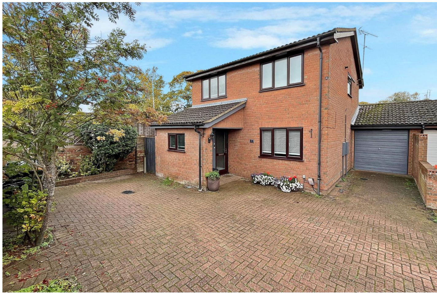
Mander Close, Flitwick, Bedfordshire, LU5 6AX