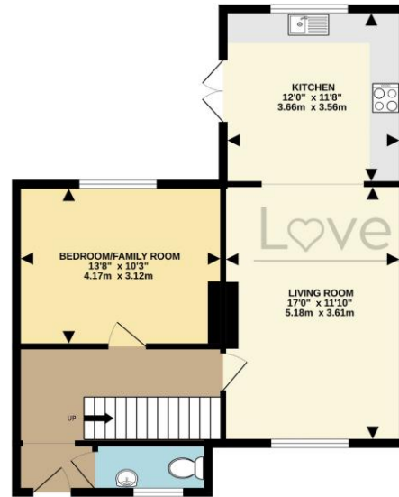
GROUND FLOOR 617 sq.ft. (57.3 sq.m.) approx.