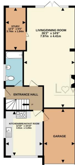
GROUND FLOOR 843 sq ft. (78.3 sq.m.) approx.