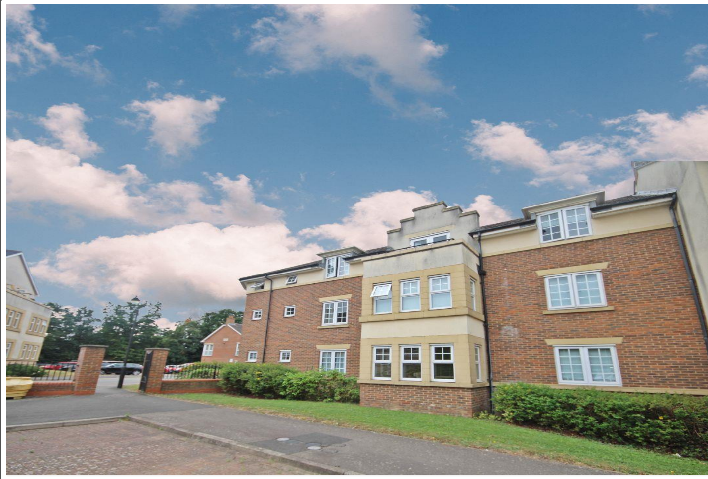
The Hawthorns, Flitwick, Bedfordshire MK45 1FL