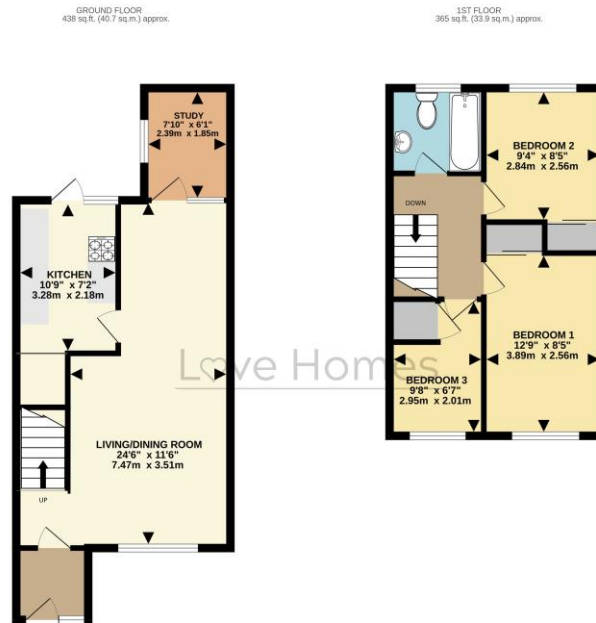
TOTAL FLOOR AREA: 803 sq.ft. (74.6 sq.m.) approx. Created by Love Homes for illustrative purposes only. Measurements and areas shown are approximate. Made with Housify 1/2024