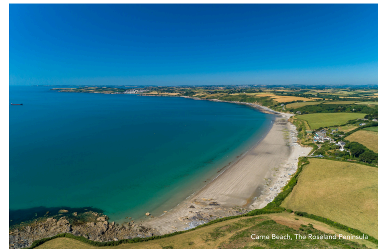
Carne Beach, The Roseland Peninsula