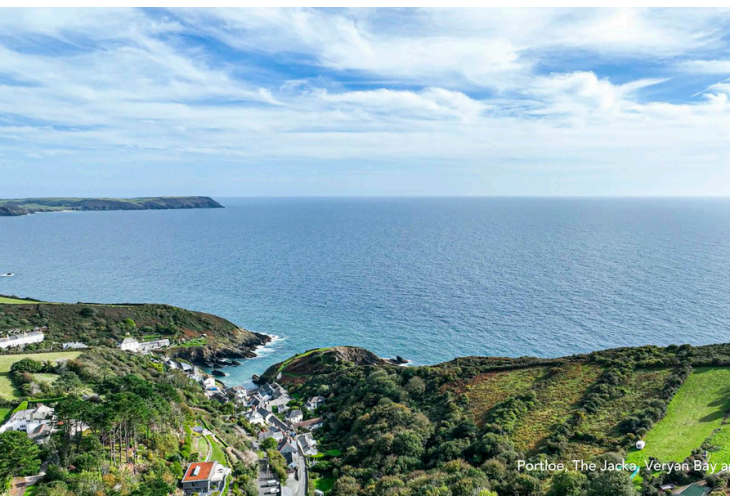
Portloe, The Jacka, Veryan Bay and